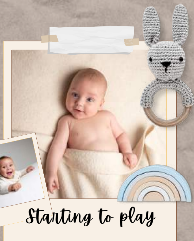
Starting to play